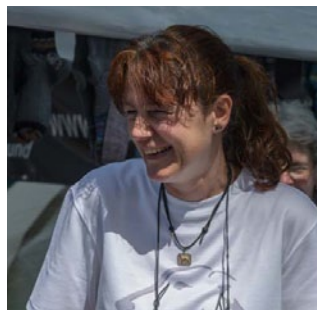
03. and 04.08.2013 – "Windhundtage" in Donaueschingen.