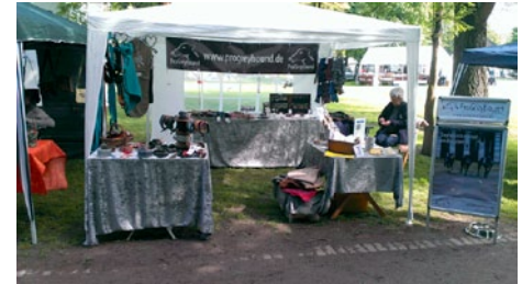
25.05.2013 – "Hunde-Event 2013" in Mülheim an der Ruhr.