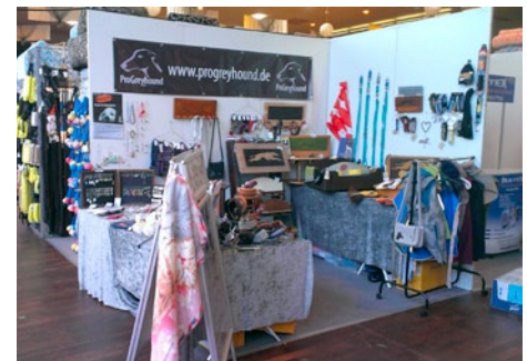
08. and 09. 06.2013 – "Bello die Hundemesse" in Wesel.