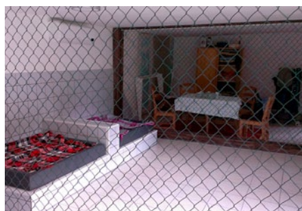
October 2013: The first foster dogs can move.