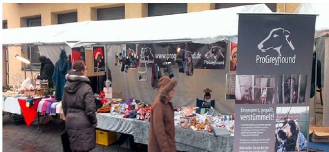
07.12.2013 – "Der besonderer Weihnachtsmarkt" in Krefeld.