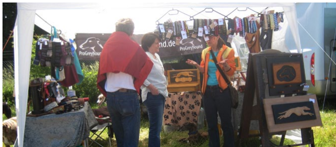
16.06.2013 – Greyhound Festival of the Galgohilfe in Coesfeld.