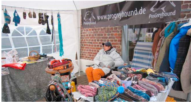
16. und 17.03.2013 – "Stahlwerkfest Willich".