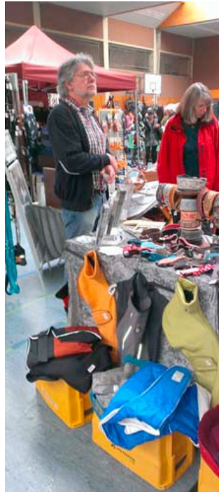
28.04.2013 – "Pfotenmesse" in Remagen.