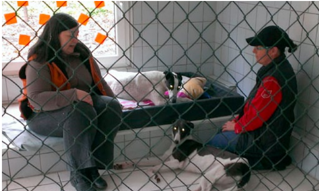
In October 2013 our first foster dogs Faith and Frankie were able to move in the foster home.