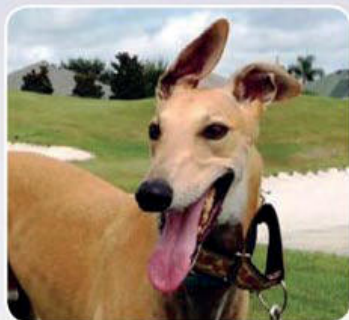
Zipper of Florida